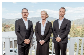
The Sales Team 03 5755 1307

View : https://www.dickensrealestate.com.au/sale/vic/north-eastern/wandiligong/residential/home/7583870