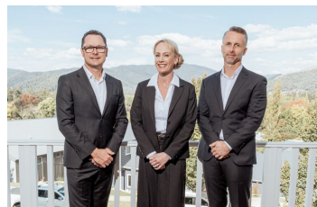
The Sales Team 03 5755 1307

Price : $1,295,000 Land Size : 3000 sqm View : https://www.dickensrealestate.com.au/sale/vic/north-eastern/wandiligong/residential/home/8029897