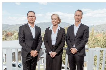
The Sales Team 03 5755 1307

Price : $1,595,000 Land Size : 2335 sqm View : https://www.dickensrealestate.com.au/sale/vic/north-eastern/harrietville/residential/house/8110962