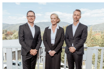
The Sales Team 03 5755 1307

Type : Unit Building Size : 60 sqm Land Size : 60 sqm View : https://www.dickensrealestate.com.au/sale/vic/north-eastern/mount-beauty/residential/unit/8118469