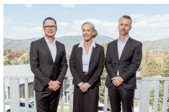
The Sales Team 03 5755 1307

Type : Townhouse Price : $1,450,000 Land Size : 227 sqm View : https://www.dickensrealestate.com.au/sale/vic/north-eastern/bright/residential/townhouse/8158930