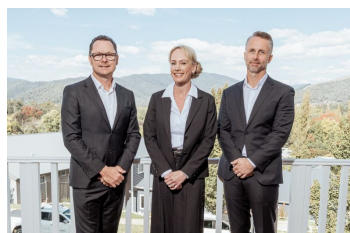
The Sales Team 03 5755 1307

Type : House Price : $695,000 Land Size : 666 sqm View : https://www.dickensrealestate.com.au/sale/vic/north-eastern/bright/residential/house/8179429